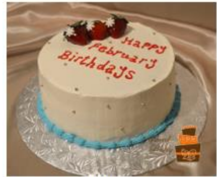
February Birthstone - Amethyst February Birth Flowers - Violet

psst... lent starts tomorrow. enjoy your fat tuesday, but not too much.